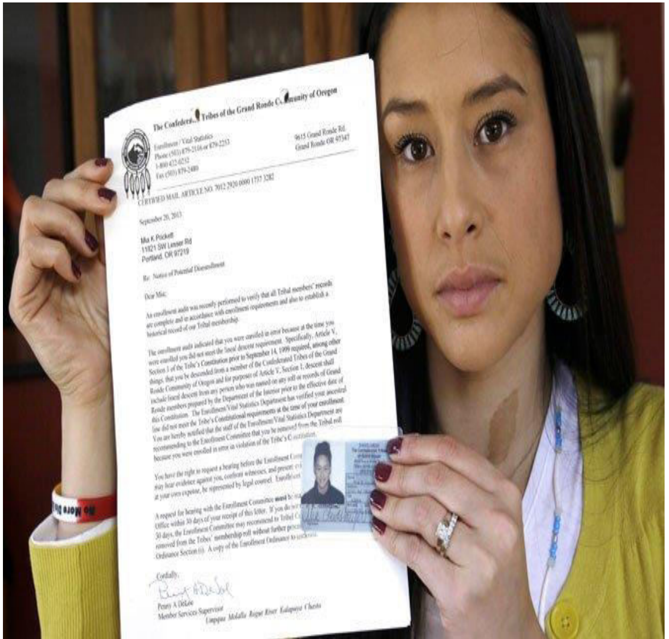
Letter from a Tribe or Council of your enrollment status